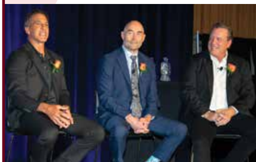
(L-R) Chris Chelios, Ed Belfour & Jeremy Roenick, Sports Dinner Keynote Speakers