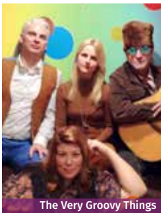
The Very Groovy Things

Sistema Winnipeg is a daily, intensive, music education program that uses music as a tool for social change. A partnership between the Winnipeg Symphony Orchestra, Seven Oaks School Division and Winnipeg School Division, approximately half of Sistema students are newcomers to Canada, and one third come from an Indigenous background. The students receive musical training after school for three hours a day, five days a week, at no cost to their families.