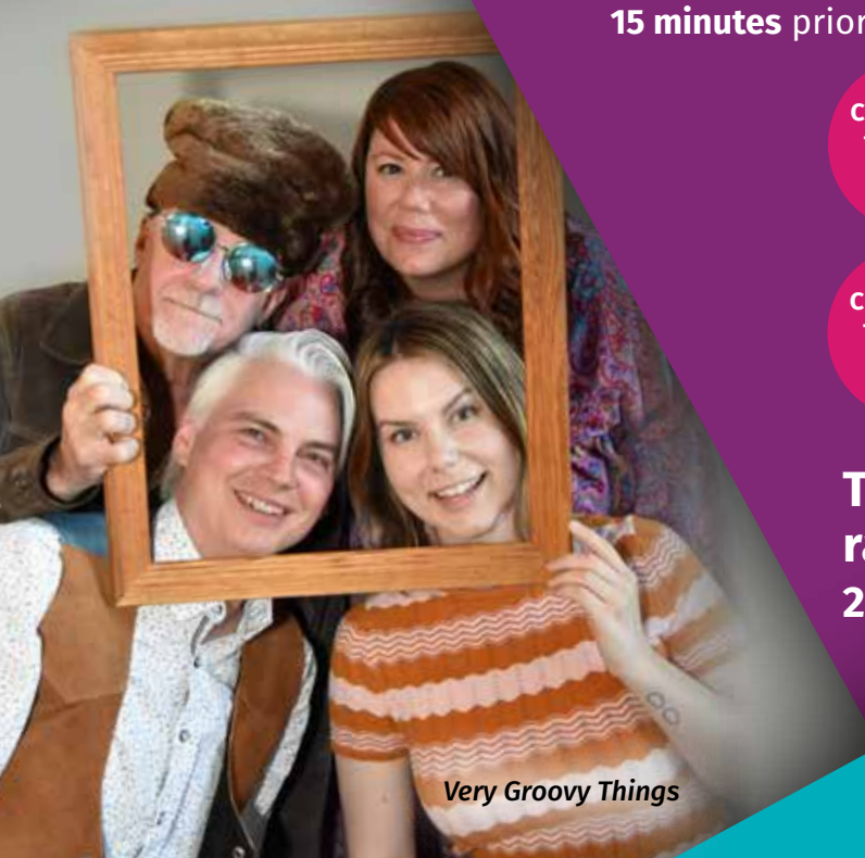
Very Groovy Things