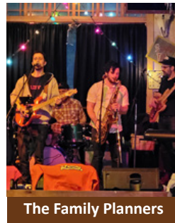
The Family Planners

Tom Jobim: Where's the Love? Nova Brasil Collective showcases the work of the most influential Brazilian composer of all time, Antonio Carlos (Tom) Jobim. Featuring classics from early Bossa Nova, such as The Girl from Ipanema , and One Note Samba , as well as later works inspired by nature; Nova Brasil captures the breadth of Jobim's life as a composer. Sung in Portuguese and English, this large ten-person ensemble of musicians from Brazil and Canada portrays the sonority of Jobim's original musical ensemble.