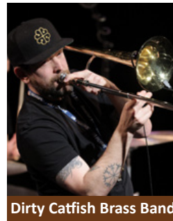
Dirty Catfish Brass Band

A Trip to New Orleans. Dirty Catfish Brass Band closes out our season with a blast. Invoking the sounds of brass bands and funk ensembles, the collective dares to reimagine the streets of a prairie city as one that is hot, alive and brimming with soul. The crew strives to pay homage to the New Orleans tradition by giving it a new audience in an unsuspecting locale. But mostly, they just want you on your feet. Get ready to move!