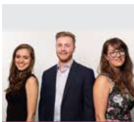
Liedert Competition Winners